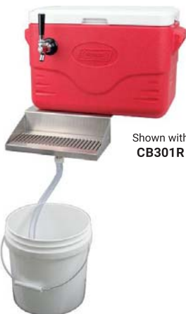
Shown with CB301R