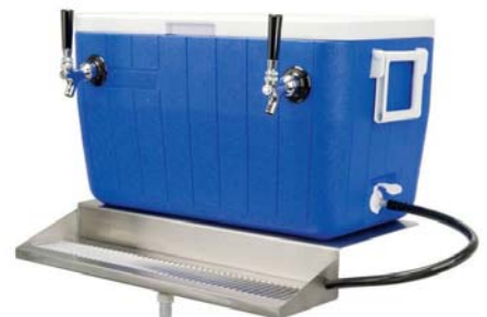
Shown with HDCP-D2-48B