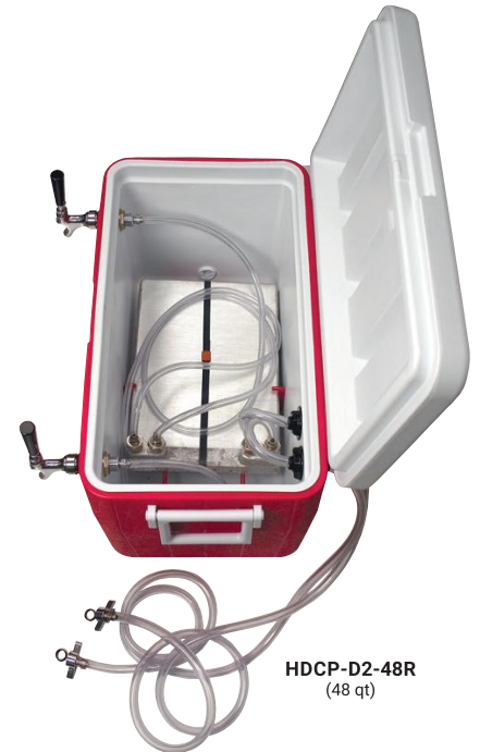
HDCP-D2-48R (48 qt)

NOTE: Rack included on all cold plate coolers. A cold plate should never sit in water.