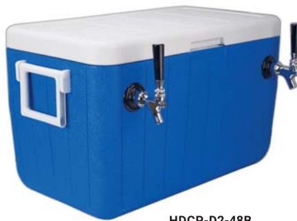
HDCP-D2-48B (48 qt)